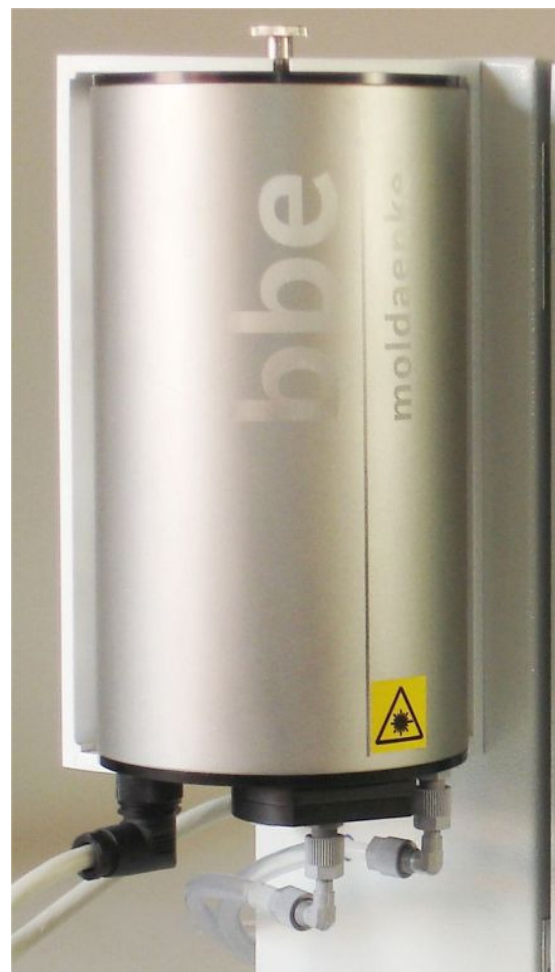
The AlgaeGuard , the smaller brother of the well-established AlgaeOnlineAnalyser , is becoming a prominent instrument in measuring stations.