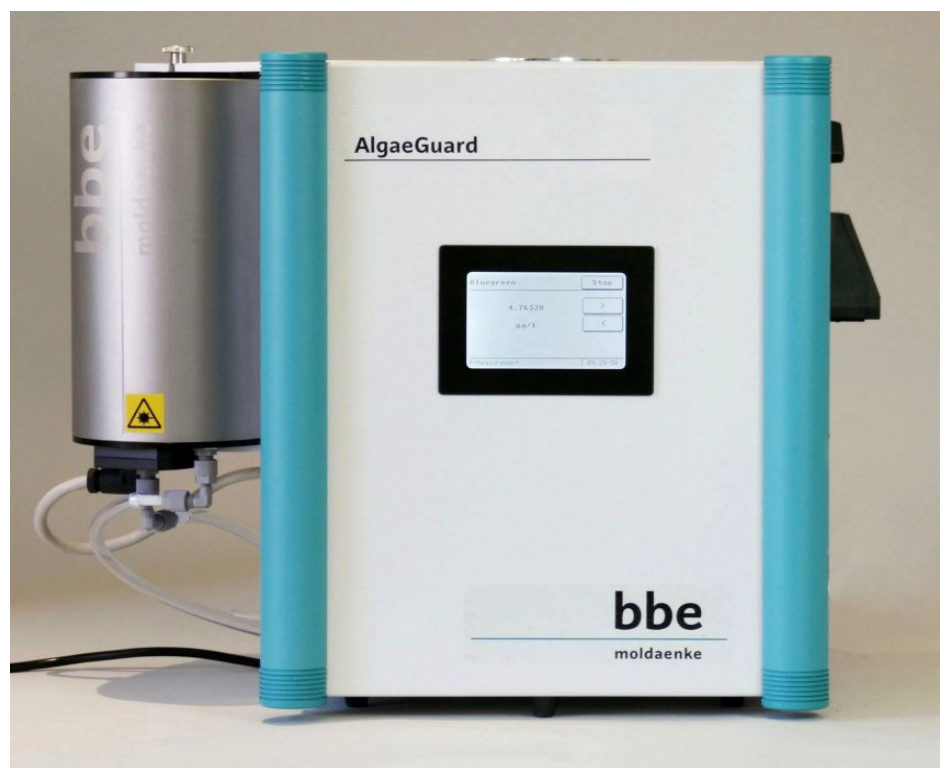
bbe AlgaeGuard: with sensor (left), 15" touchpad display

Pressing START on the touchscreen enacts the illumination program of the sample inside the chamber.